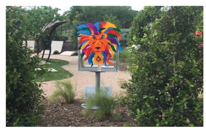
Little Free Library designed by OfficeSource, Ltd.