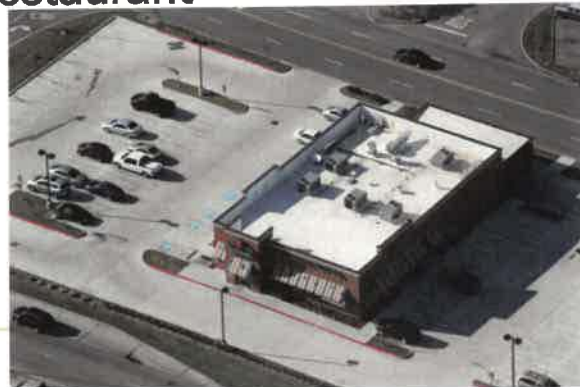
Applebee's— 6,200 sq. ft. Beaumont, TX