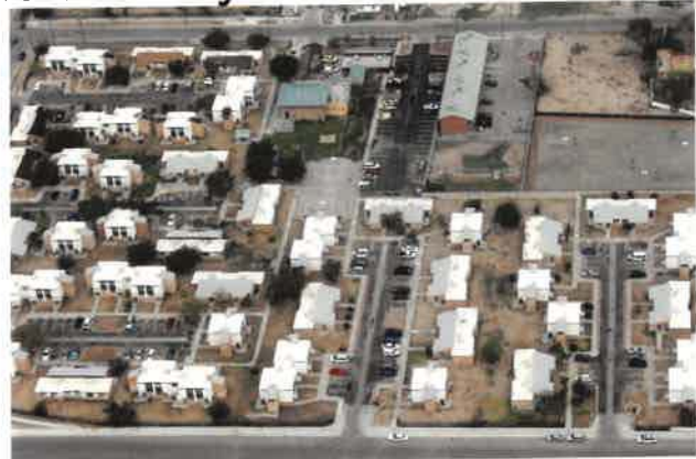
Housing Authority City of El Paso (HACEP) — 7 complexes 500,000+ sq. ft.