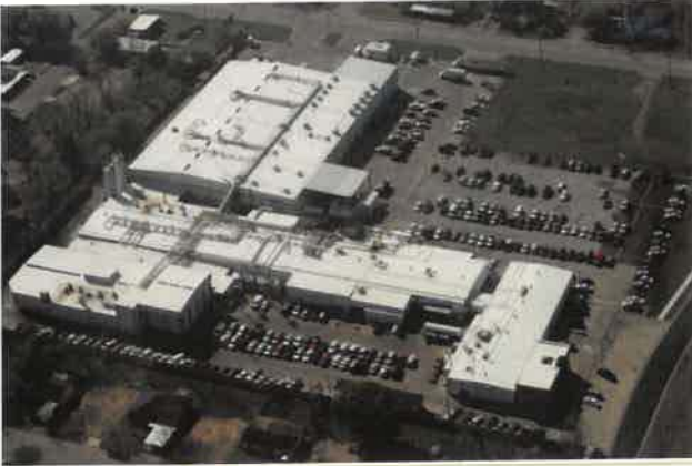
Schwan Foods—130,000 sq. ft. Pasadena, TX