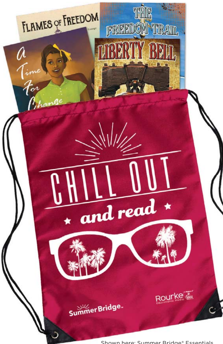
Shown here: Summer Bridge® Essentials Backpack for grades 5-6 with contents