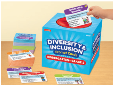
Diversity & Inclusion Prompt Cards

Our elementary products target core subject areas—from literacy, language and diversity to math, science and STEM. With an emphasis on versatility, we offer standards-based materials designed for a variety of instructional methods—including project-based, small-group and independent learning.