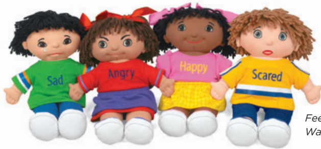
Feelings & Emotions Washable Dolls

We know that little ones love to investigate the world around them. So our product developers create infant & toddler materials that invite lots of exploration—while withstanding wear & tear and keeping children safe.