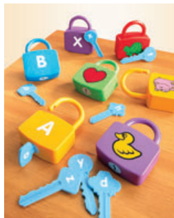
Alphabet Learning Locks