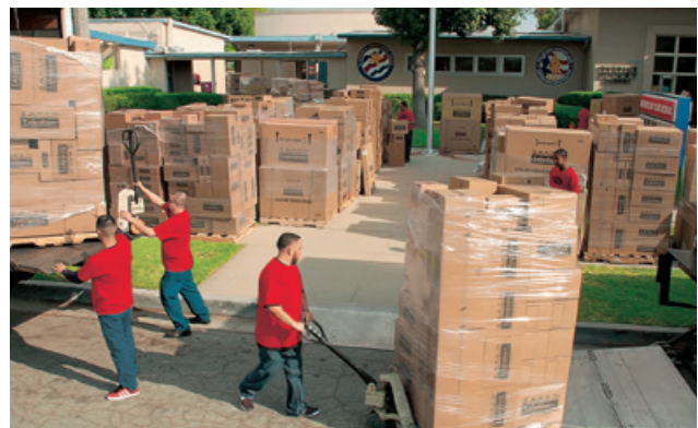
Super-fast, comprehensive service from order to delivery!