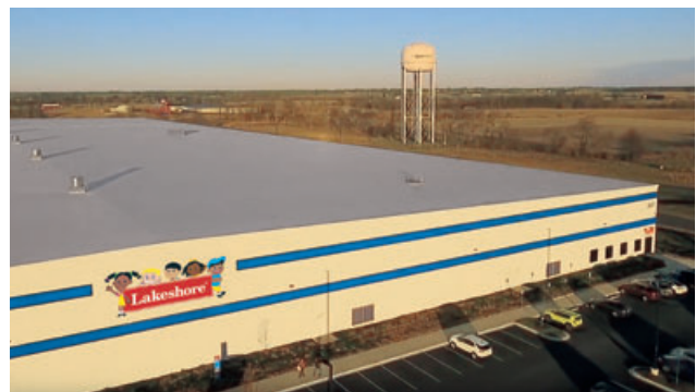
Our eastern distribution center in Midway, Kentucky.

Our products are available in over 70 countries—and the list is growing! Plus, Lakeshore distributors are committed to upholding our standards of excellence and service.