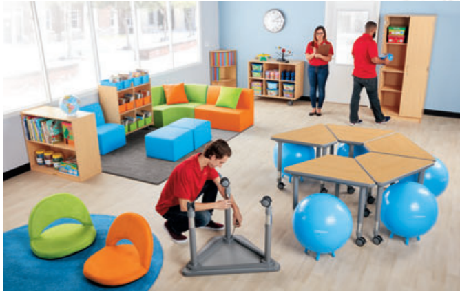
Complete Classrooms service is provided for orders of $10,000 or more that ship to a single location in the contiguous United States. Depending on delivery location, additional charges may apply.