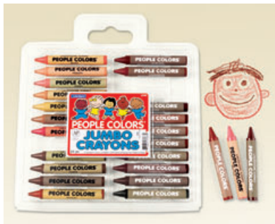
People Colors® Crayon Pack

As children grow, their developmental needs change. Our products for preschool & prekindergarten reflect this change—promoting learning and discovery, creative expression and social-emotional development.