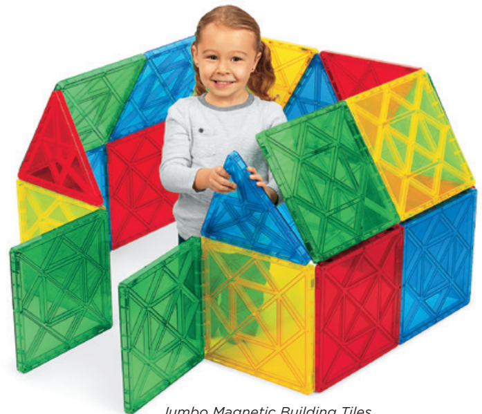
Jumbo Magnetic Building Tiles