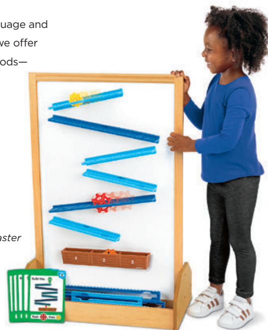
Engineer-A-Coaster Activity Kit