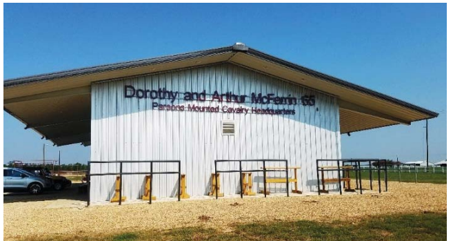
TAMU Mounted Cavalry Facility