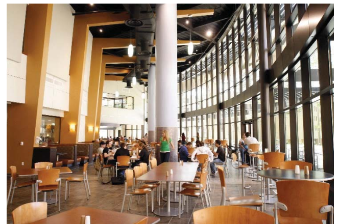
UT Tyler University Center Dining Hall