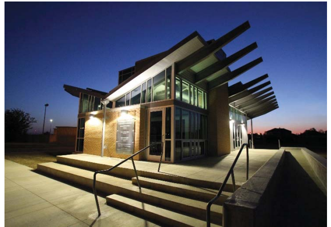
UNT Net Zero Lab