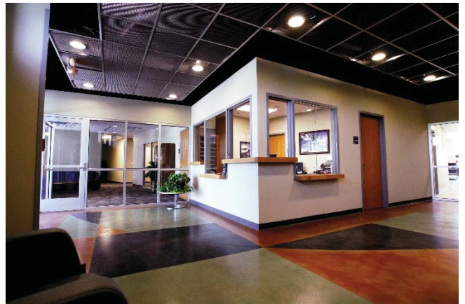
UTD Facilities Management Offices