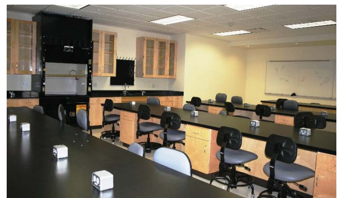
UT Tyler Biology Building Addition