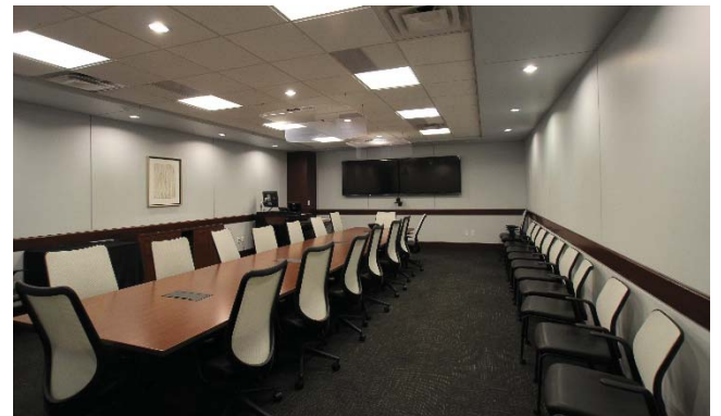
UTD Administration Bldg. Conference Rm. Remodel