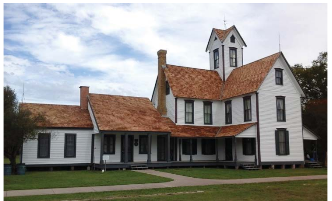
City of Mesquite Lawrence House Historical Reno.