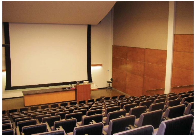
UTD Kusch Auditorium Renovation

We thank you for considering Nouveau for your projects.