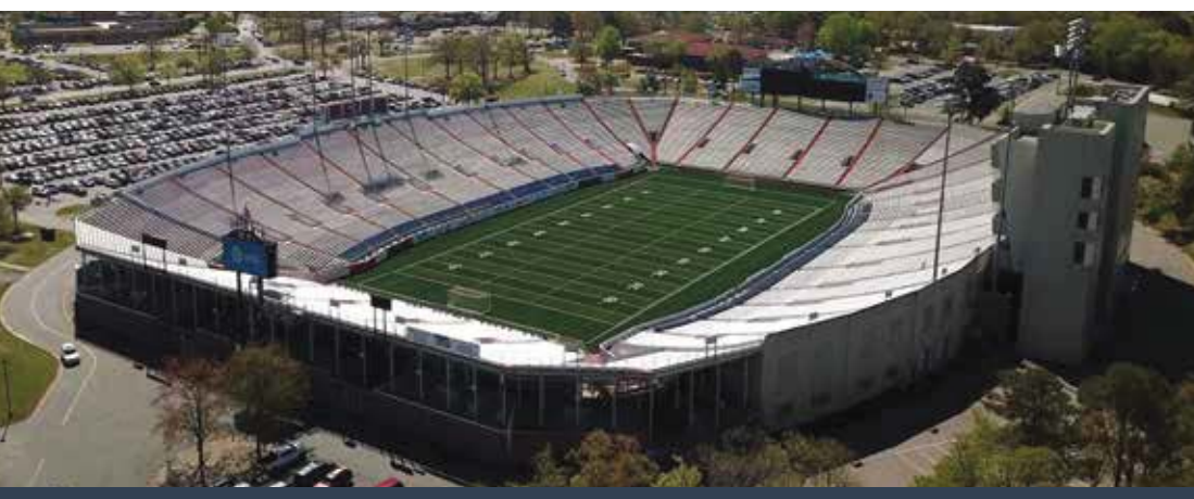
Little Rock, AR - War Memorial Stadium