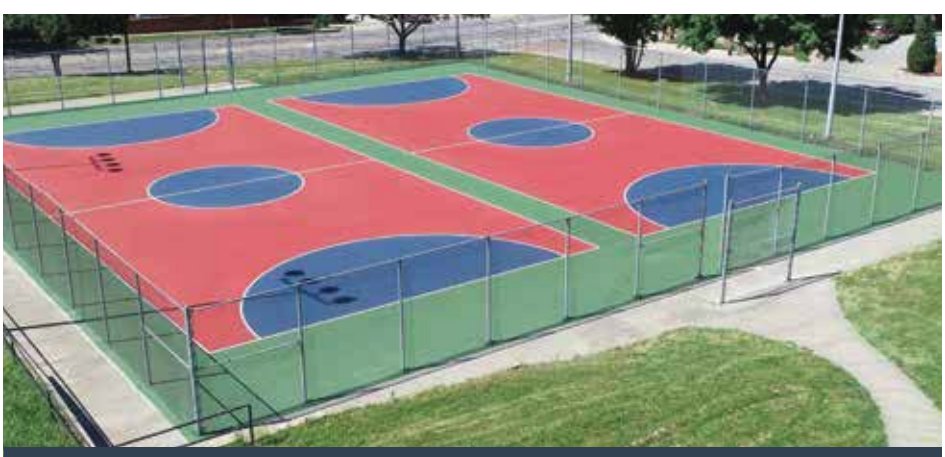
Kansas City, MO - Prospect Plaza Futsol Facility