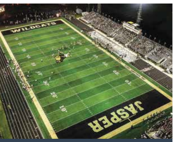
Jasper, IN - Jerry Brewer Stadium Field