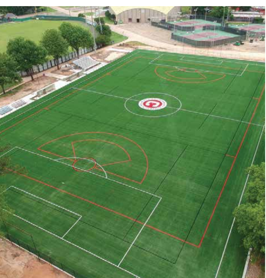
Shreveport, LA - Mayo Field at Centenary College of Louisiana