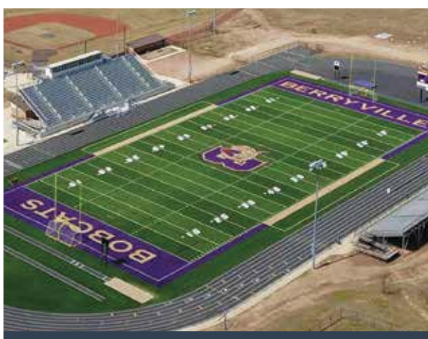
Berryville, AR - Berryville Track & Field