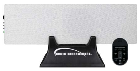
BEAM Configuration w/Power Base