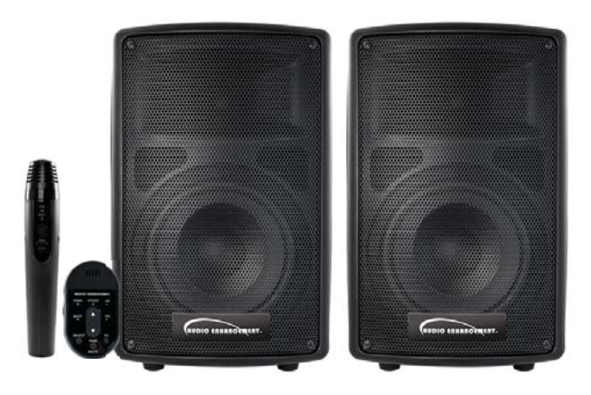
XDSolo Pal System w/Companion Speaker