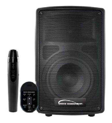
XDSolo Pal System