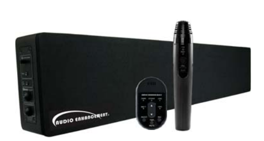
Cart- and Wall-Mount Configuration