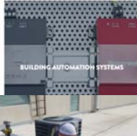
BUILDING AUTOMATION SYSTEMS