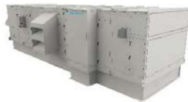
Skyline® Semi-Custom Outdoor Air Handler 900 to 65,000 cfm