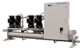
Scroll Chiller 30 to 200 tons