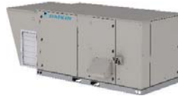
Rebel® Commercial Outdoor Air Handler 500 to 11,500 cfm