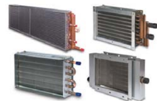
Chilled Water, Hot Water, Steam, & DX Coils 1 to 12 rows