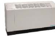
Enfinity® Console In-Room ½ to 1½ tons