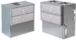
SmartSource® Dedicated Outside Air System 600 to 4000 cfm