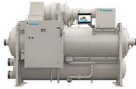
Centrifugal Chiller, Single Compressor 300 to 1,800 tons