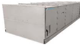
RoofPak® Semi-Custom Rooftop Air Handler 4,000 to 50,000 cfm