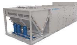
Maverick® II Cooling & Heat Pump 15 to 75 tons