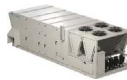
Rebel Applied™ Heating & Cooling w/Inv. Compressor 30 to 52 tons