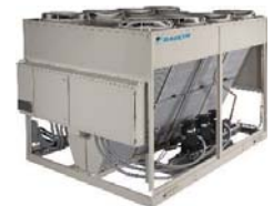
Dual Circuit Scroll Condenser 15 to 140 tons