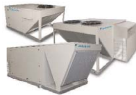
Rebel® Cooling and Heat Pump w/Inv. Compressor 3 to 28 tons