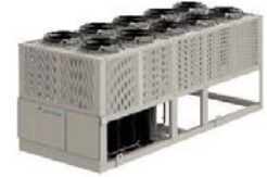
Trailblazer® Scroll Chiller 10 to 240 tons