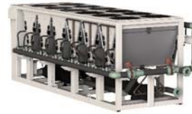
Pathfinder® Screw Chiller w/Free Cooling 100 to 565 tons