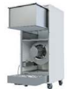
Air Purifier 500 & 1000 cfm