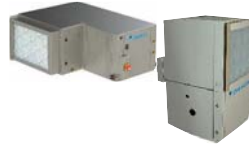
SmartSource® Compact Horizontal / Vertical ½ to 6 tons