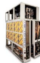
Indoor Cooling & Heating Water-cooled Condenser – Retrofit 20 to 40 tons