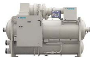
Centrifugal 3,000 to 18,000 MBh