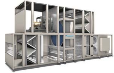
Custom Air Handler 900 – 129,000 cfm