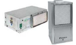
Enfinity® Horizontal / Vertical ½ to 6 tons / ¾ to 6 tons