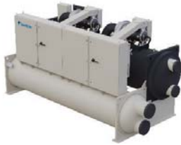
Magnitude® Magnetic Bearing Centrifugal Chiller 86 to 1,600 tons