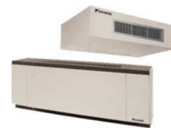
Ceiling & Floor Units 750 to 2,000 cfm