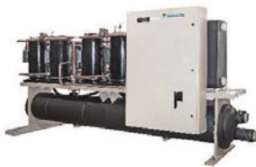
Scroll 500 to 3,100 MBh