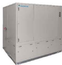
Indoor Cooling & Heating Water-cooled Condenser – Unitary 20 to 130 tons