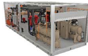
Modular Central Plant Up to 10,000 tons Cooling & 100,000 MBh Heating