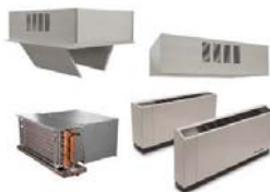
ThinLine Vertical & Horizontal 200 to 1,200 cfm