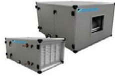
Destiny® Commercial Indoor Air Handler 600 to 15,000 cfm