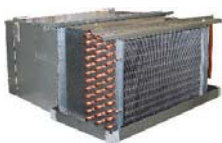
Large Capacity 600 to 3,000 cfm