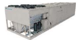
RoofPak® Heating & Cooling w/Inv. Compressor 15 to 150 tons