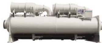
Centrifugal Chiller, Dual Compressor – Dual Circuit 1,200 to 2,700 tons