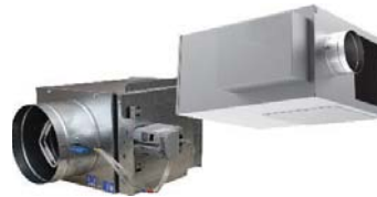
Single Duct & Series / Parallel PIUs 80 to 8000 cfm