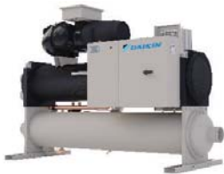
Navigator™ Screw Chiller 120 to 300 tons