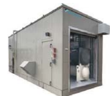
Packaged Mechanical System Up to 10,000 tons Cooling & 100,000 MBh Heating