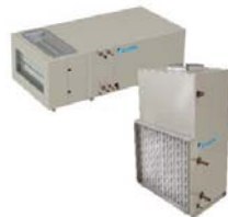
PreciseLine™ Large Capacity Blower Coil 600 to 5,000 cfm