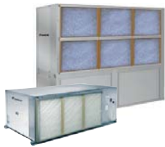
Large Capacity Horizontal / Vertical 6 to 25 tons