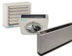
Horizontal, Vertical, & Cabinet Unit Heaters 200 to 12,350 cfm