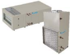
PreciseLine™ Lg. Capacity Indoor Air Handler 600 to 5,000 cfm