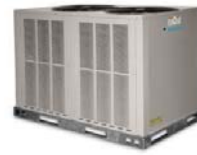
Single Circuit Scroll Condenser 6 to 20 tons