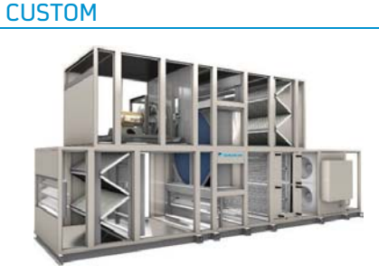
Custom Air Handler 900 – 129,000 cfm