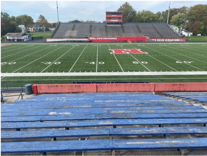
An overview of the visitors bleachers.