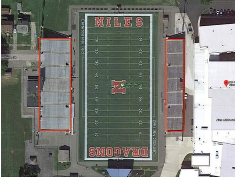
An aerial view of the stadium. The bleachers covered under this proposal are outlined in Red.