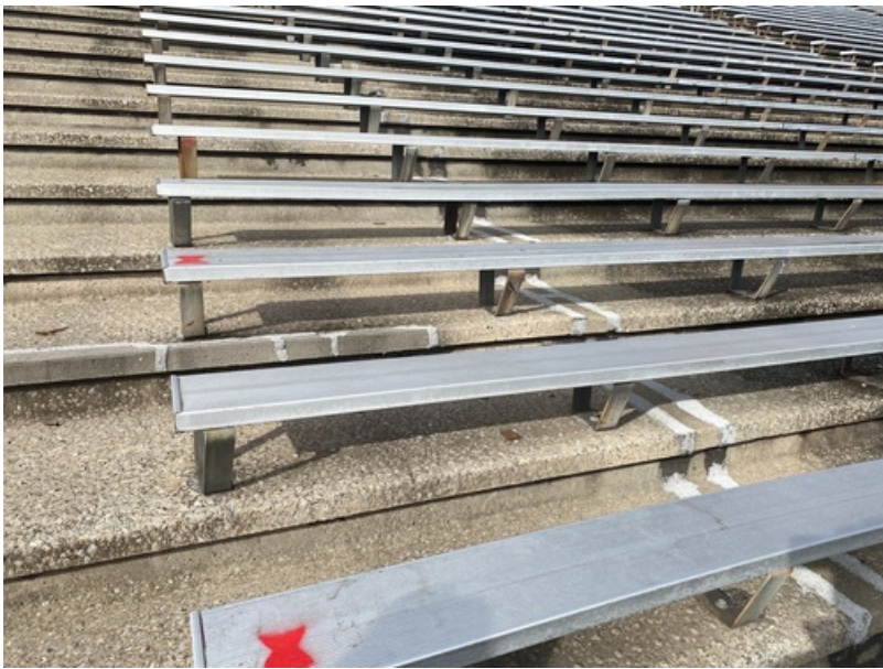
An overview of the home bleachers.