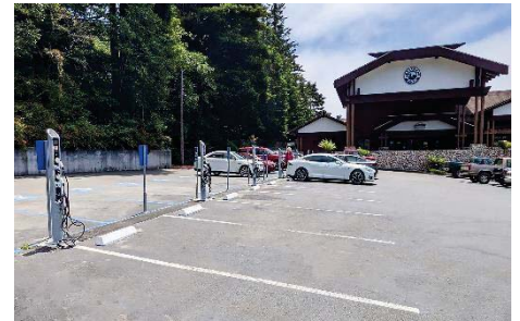
Hospitality Charging Solution Cher-Ae Heights Casino, California