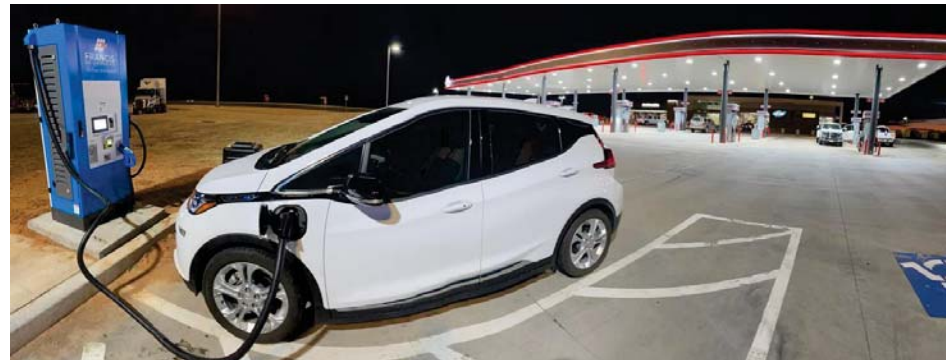
Convenience Store Solution Midwest USA