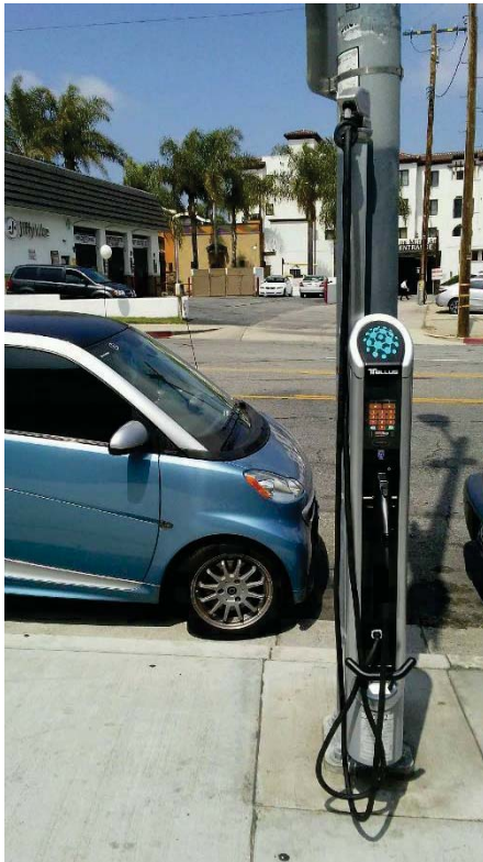
On-Street EV Charging L.A. Bureau of Street Lighting