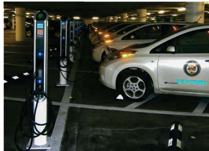
City of Houston Fleet Charging 40 Dual Port L2 Stations, Since 2013