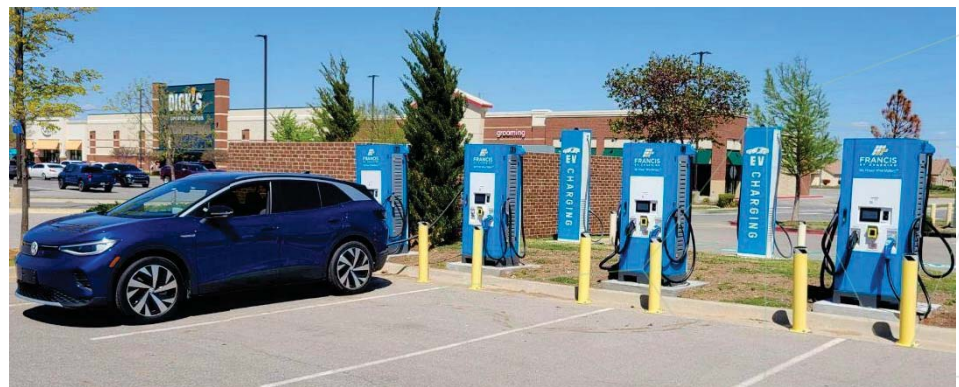
Public Charging, Oklahoma Francis Energy 120 Ports DCFC