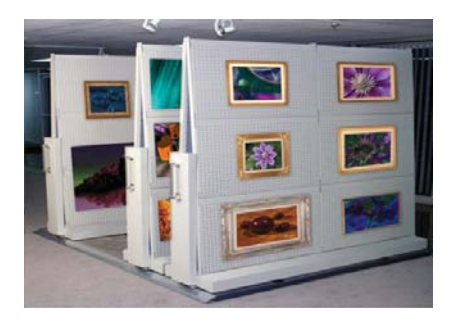
THE WORDEN COMPANY