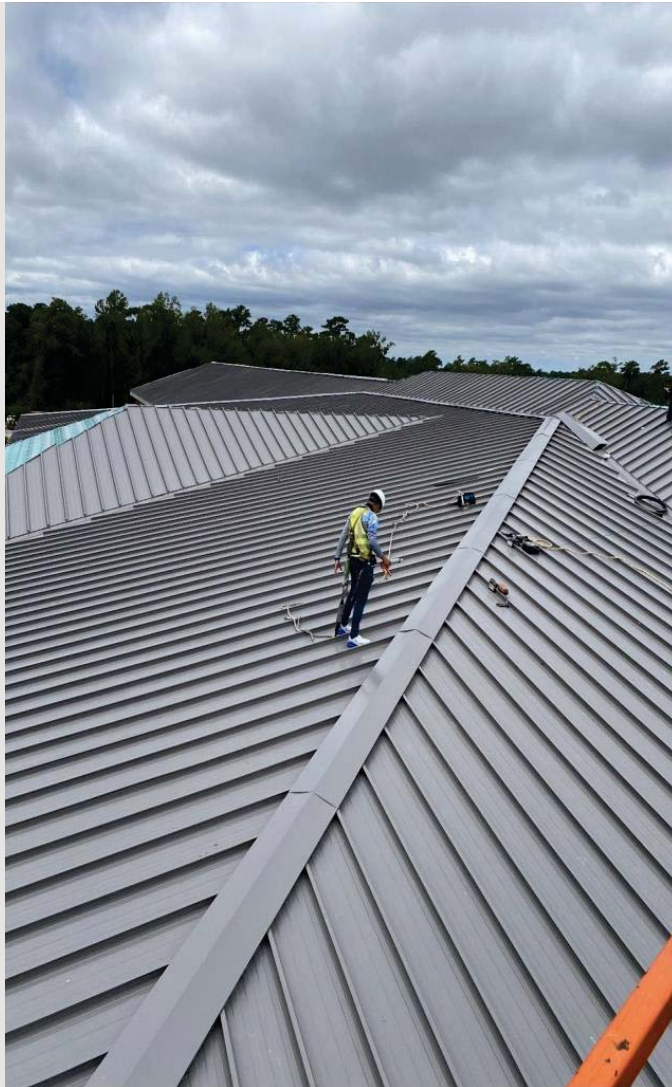
Standing Seam Metal Camp LeJeune, NC