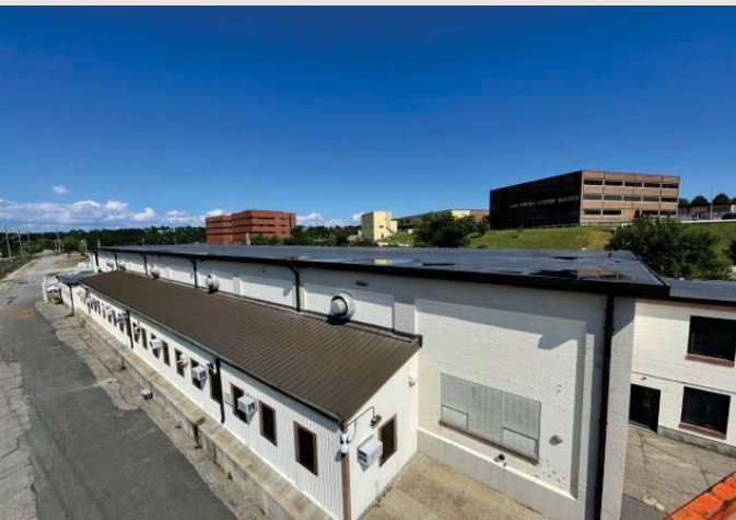
EPDM/Standing Seam Metal/Gutters Newport, RI