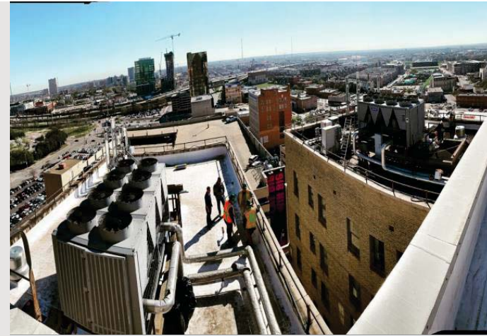
TPO Dallas, TX