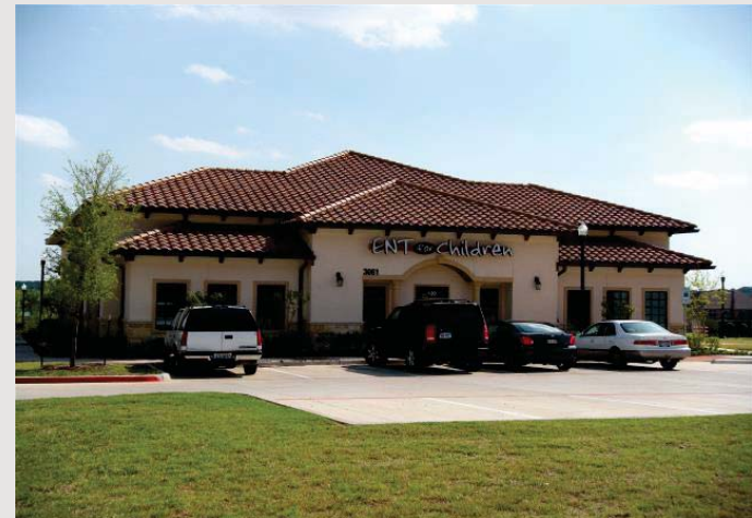
Concrete Tile Southlake, TX.