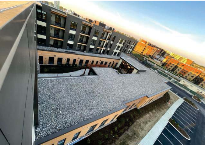
New Construction Ballasted TPO Blue Ash, OH