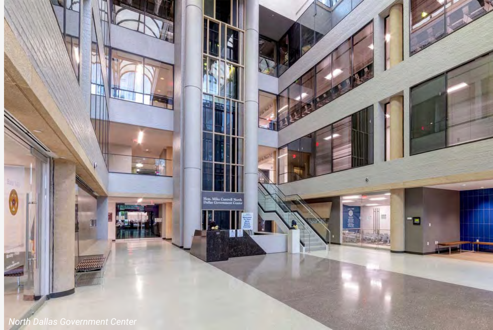
North Dallas Government Center