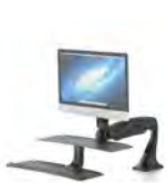
StandUp ® A1

Neutral Posture offers an assortment of workplace accessories in order to ensure a complete ergonomic workstation.