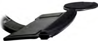
Keyboard Trays & Arms