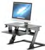
StandUp ® X1