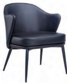
Manta 24.4"W x 27.6"D x 31.1"H