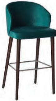
Santa Rosa 22"W x 19.75"D x 44.5"H