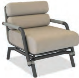
VEN550-AMA101 29.5"W x 36"D x 30"H