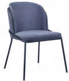
Elias 22.8"W x 24"D x 32.3"H