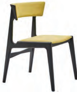
Moxie 18"W x 17.5"D x 31.9"H