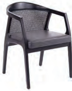
Briar 17.5"W x 20"D x 32.5"H