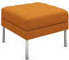
Hemingway 26"W x 26"D x 18"H