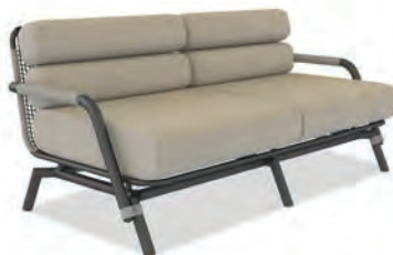
VEN550-AMA103 74.25"W x 36"D x 30"H