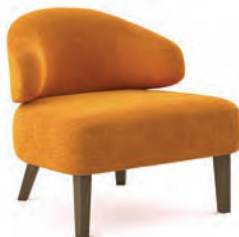
Calabajas 30"W x 33"D x 29"H