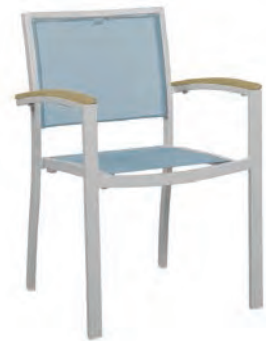
VEN550-SLU302 22.5"W x 21.25"D x 33.5"H