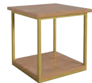
Notus Side Table 24"W x 24"D x 24"H