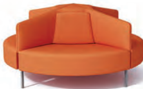
Cairo 72"W x 40"D x 20"H