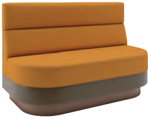
Hialeah 48"W x 28"D x 39"H