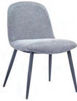
Silas 20.5"W x 24.8"D x 32.2"H