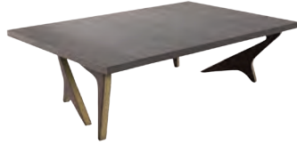
Anastasia Coffee Table 32"W x 48"D x 15.25"H