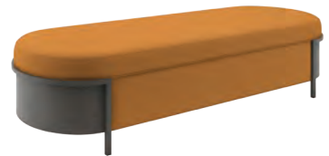
Dothan 33"W x 85"D x 18"H