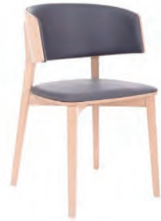
Mara 20.5"W x 20.3"D x 31.3"H