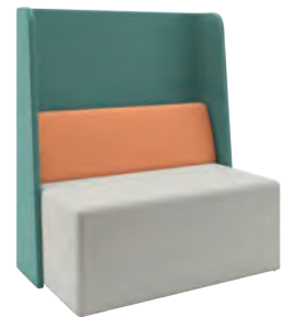
Sausalito 48"W x 31"D x 54"H