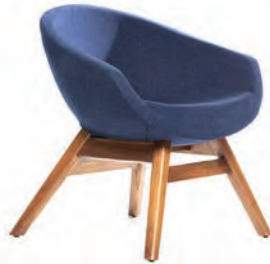
VEN550-SAN101 25.5"W x 24.5"D x 27.5"H