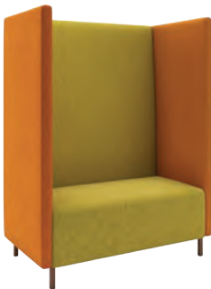
Anniston 60"W x 28"D x 62.5"H