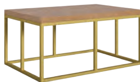
Notus Coffee Table 28"W x 42"D x 24"H