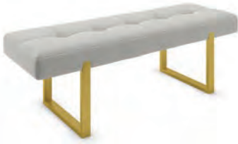
Stockton 20"W x 60"D x 19"H