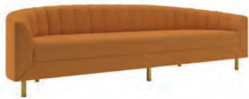
Brickell 96"W x 27"D x 28"H