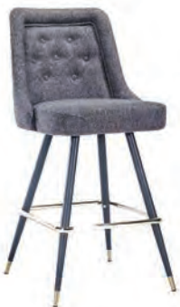
Kimi 20.1"W x 22.4"D x 39.8"H