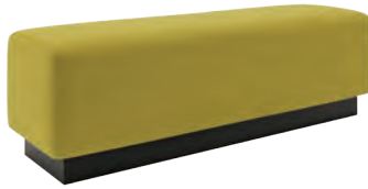
Gadsden 18"W x 60"D x 18"H