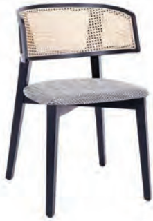
Mara 18"W x 17"D x 47"H