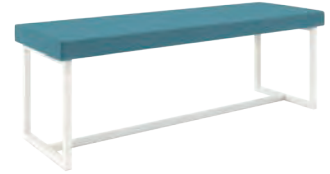
Greco 18"W x 52"D x 18"H