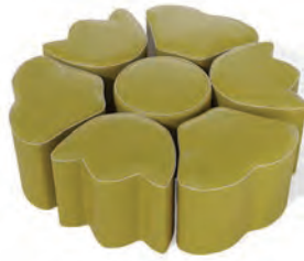
Nola 54"DIA x 18"H