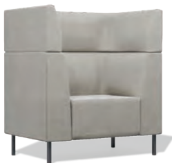
Artemis 45"W x 29.5"D x 47"H