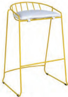
VEN550-INT401 21.5"W x 19"D x 34"H