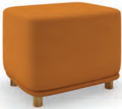
Porter 31.5"W x 24"D x 24"H