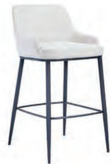
Clara 18.9"W x 21.7"D x 42"H