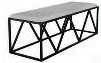
Chevron 18"W x 52"D x 18"H