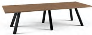
Perspective Tables Visit Website for Dimensions