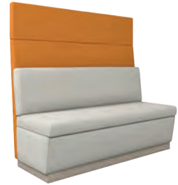
Cullman 48"W x 27"D x 57"H