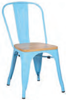
Pittsburgh 18"W x 20"D x 34"H