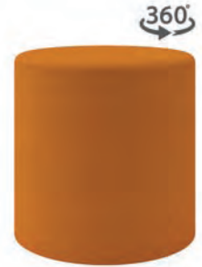
Bayport Swivel 18"DIA x 24"H