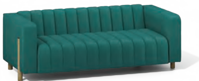
Wilfred 80"W x 37"D x 27"SH