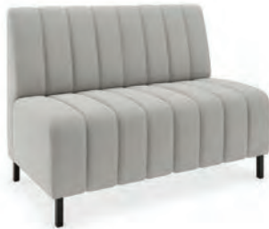
Winnie 48"W x 26"D x 36"H