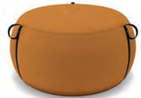
Florence 35"DIA x 18"H