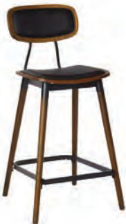
Fera 22"W x 21"D x 43.3"H