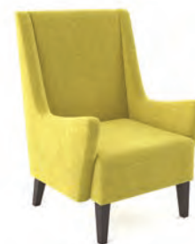
Santa Ana 28.5"W x 28"D x 42"H