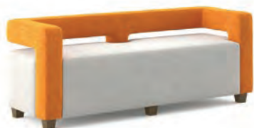
Astoria 72"W x 24"D x 27.5"H