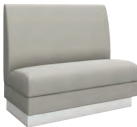
Boardwalk 48"W x 25"D x 42"H