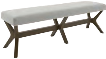
Napa 16.5"W x 60"D x 18"H