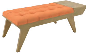
Arlington 24"W x 60"D x 18"H