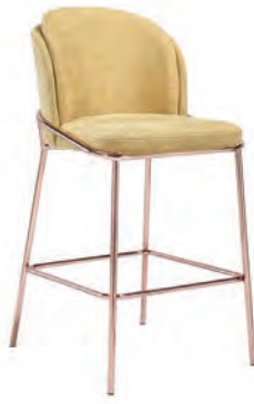
Lisette 20"W x 23"D x 39.4"H