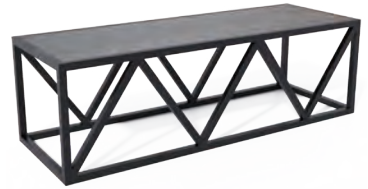
Chevron Coffee Table 18"W x 52"D x 16"H