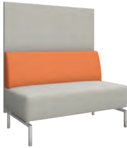
Hannibal High 48"W x 27.5"D x 55"H