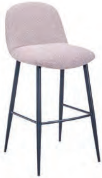
Aster 19.3"W x 22.8"D x 43.3"H