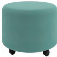
Manhattan 24"DIA x 18"H