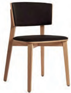
Maya 20.5"W x 20.3"D x 31.3"H