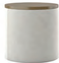
Vail 19.3"DIA x 19.3"H