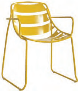
VEN550-ELL302 23.5"W x 22"D x 32.25"H