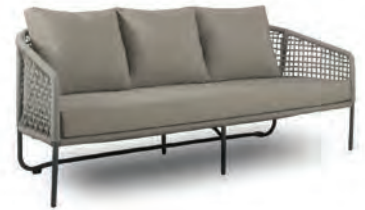
VEN550-SAR103 78.5"W x 26.5"D x 30"H