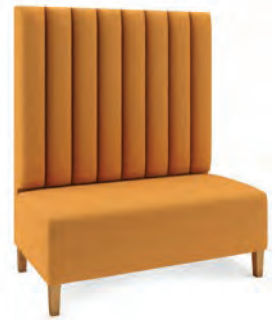
Marion 48"W x 27"D x 58"H