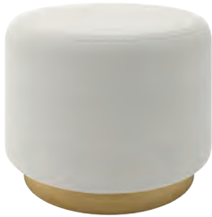
Manhattan Round 24"DIA x 18"H