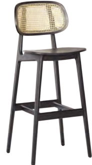
Savannah 19.5"W x 17"D x 43.25"H