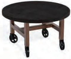
Ford Side Table 36"DIA x 20"H