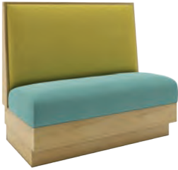
Ipanema 48"W x 25"D x 42"H