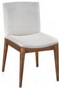
Palma Ceia 17.5"W x 16.5"D x 32"H