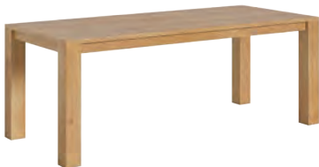
Graze Community Table 96"W x 42"D x 42"H