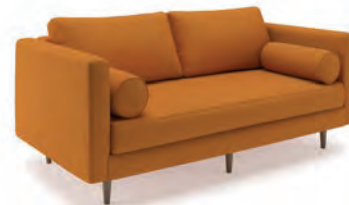
Amity 72"W x 38"D x 34"H