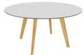
VEN550-SAN305 60"DIA x 30"H