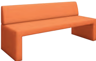
Milford 72"W x 26"D x 31"H