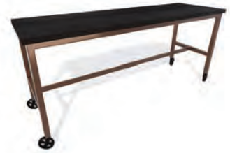
Ford Community Table 96"W x 30"D x 42"H