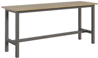
Ostro Community Table 72"W x 30"D x 42"H