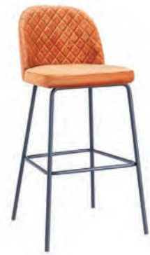
Haskell 19.3"W x 20.5"D x 40.2"H