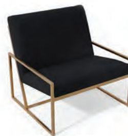
Serendipity 30.5"W x 31.5"D x 29"