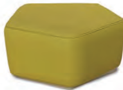
Pebble A 30" W x 37.5"D x 18"H