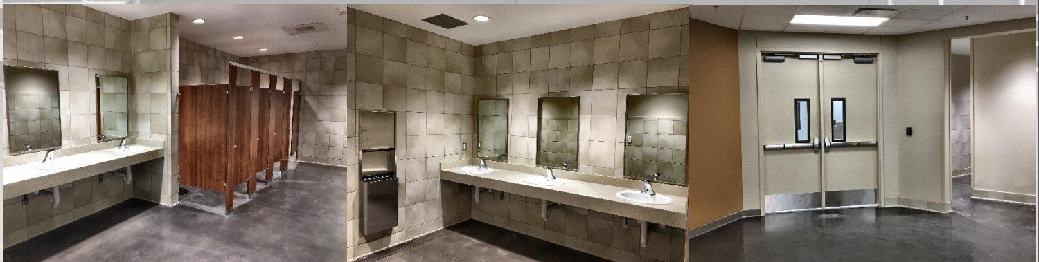
Baylor Scott & White Distribution Center – Temple, TX