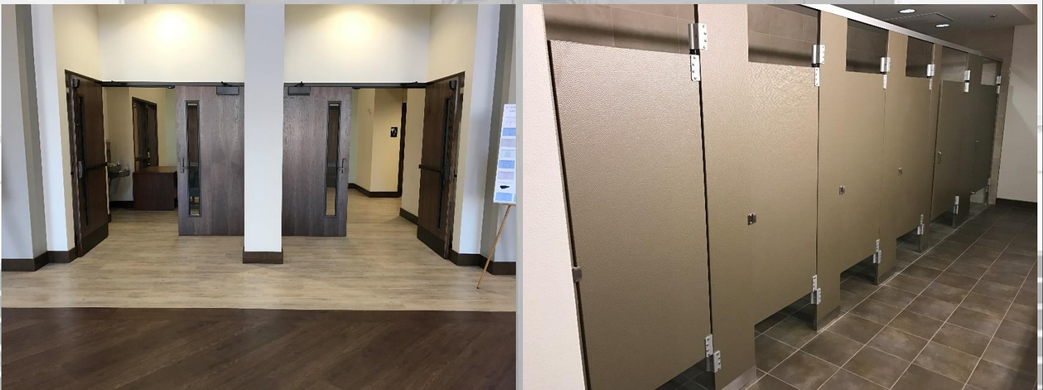
St. Jerome Catholic Church – Waco, TX

Our mission is to deliver superior products and craftsmanship according to specifications, on time and being responsive to schedule while maintaining a strong reputation for safety, quality, great employees & a value to our customers.