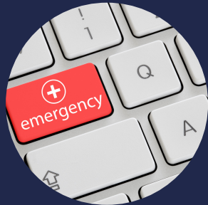
Emergency Management Software