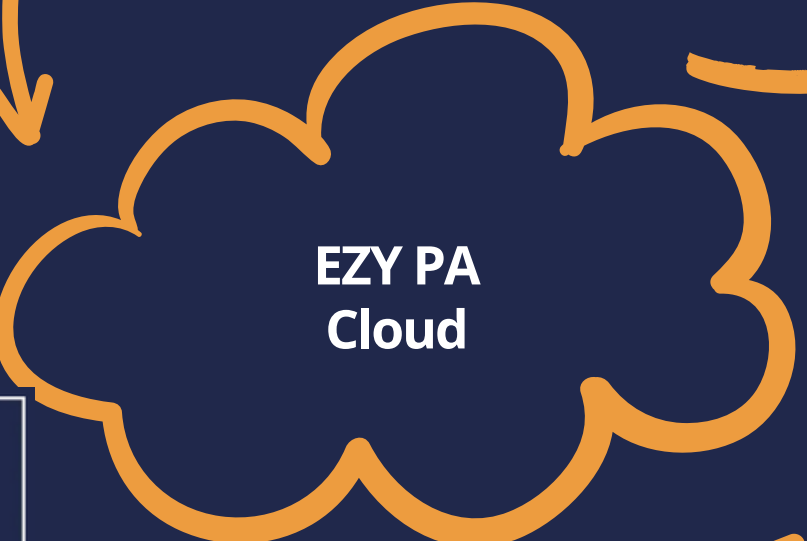
EZY PA Cloud