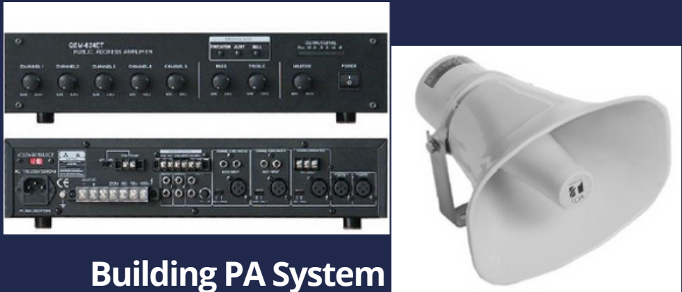
Building PA System