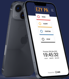
Device based interface