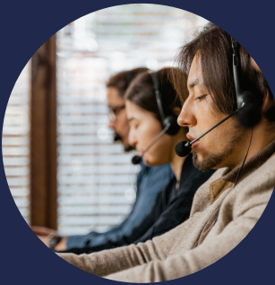
911 call centre