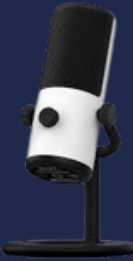
Microphone input to generic PC