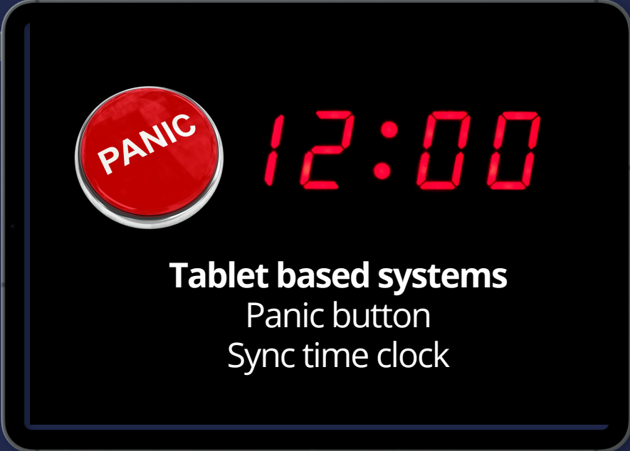
Tablet based systems Panic button Sync time clock