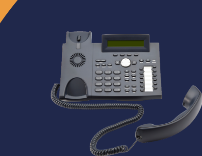
VIOP phone system