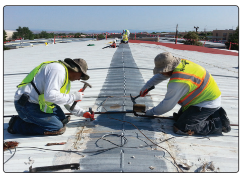
Removing old material used on previous repairs