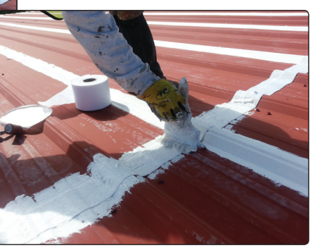
All perimeters, curbs and penetrations are sealed with Apoc 264 & reinforcing fabric