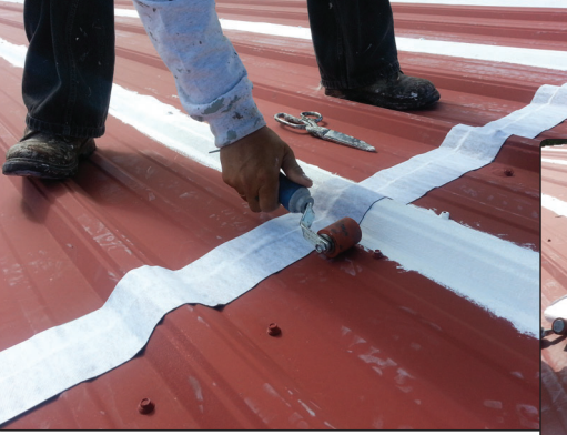
Sealing horizontal seams with Apoc Fleece-Top Incredible Repair Tape and Sealant, followed by Apoc 264