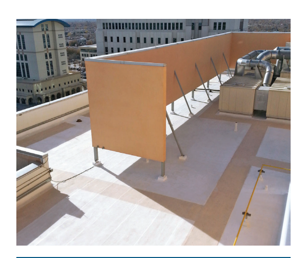
TrafficCoat, a non-skid surface, was used to clearly mark rooftop walkways