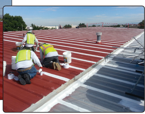
Sealing vertical seams with Apoc 264 Flash and Seal and polyester reinforcing fabric