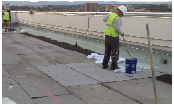
Applying the PremiumCoat® System to the existing mod bit roof