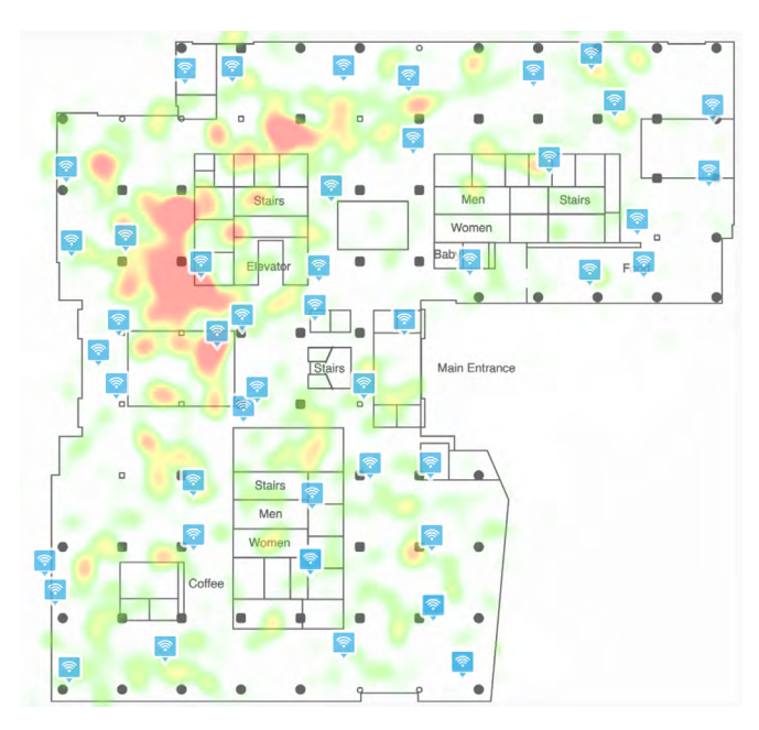
Rich analytics show detailed foot traffic patterns in a physical space.