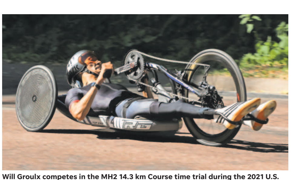
Paralympic Trials.

She was 12 years old when she competed in her first international swimming competition, the 2004 Athens Paralympics. Overall, the 29-year-old has accumulated 23 medals.