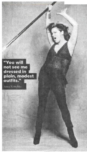
"You will not see me dressed in plain, modest outfits." — Anna Netrebko

Netrebko is set to star in the Met's Sept. 23 performance of Tchaikovsky's Eugene Onegin , making her the first soprano ever to sing leading roles in three consecutive opening nights. She opened the 2011 and 2012 seasons with Anna Bolena and another Donizetti opera, L'Elisir d'Amore , respectively.