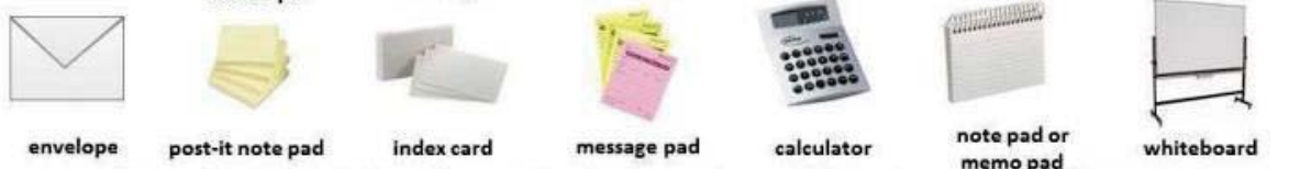
envelope post-it note pad index card message pad calculator note pad or memo pad whiteboard