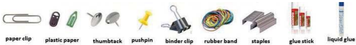
paper clip plastic paper clip thumbtack pushpin binder clip rubber band staples glue stick liquid glue