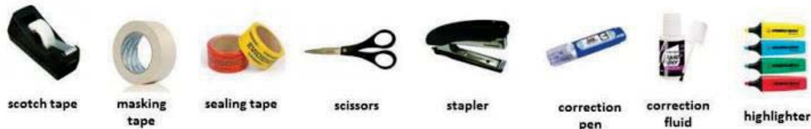
scotch tape masking tape sealing tape scissors stapler correction pen correction fluid highlighter