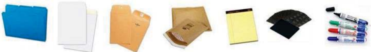
file folder catalog envelope clasp envelope mailer envelope legal pad carbon paper whiteboard markers