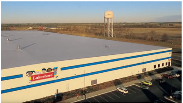
Our eastern distribution center in Midway, Kentucky.

Our products are available in over 70 countries—and the list is growing! Plus, Lakeshore distributors are committed to upholding our standards of excellence and service.