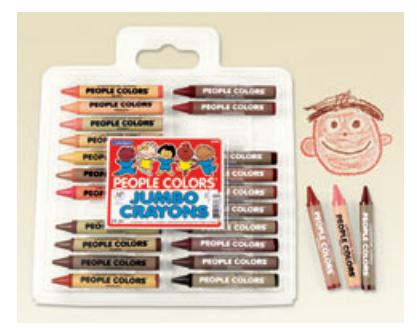
People Colors® Crayon Pack

As children grow, their developmental needs change. Our products for preschool & prekindergarten reflect this change—promoting learning and discovery, creative expression and social-emotional development.