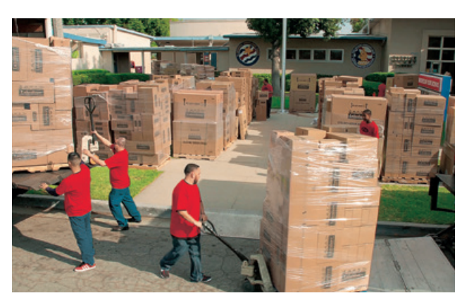
Super-fast, comprehensive service from order to delivery!