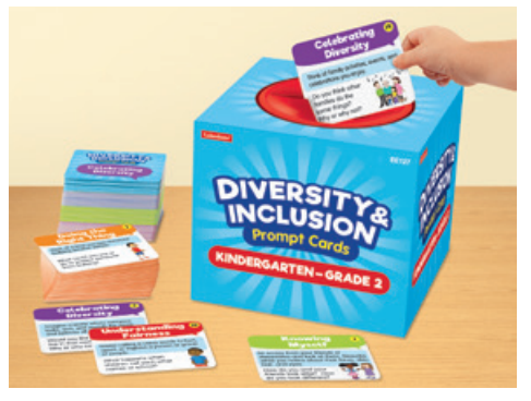
Diversity & Inclusion Prompt Cards

Our elementary products target core subject areas—from literacy, language and diversity to math, science and STEM. With an emphasis on versatility, we offer standards-based materials designed for a variety of instructional methods—including project-based, small-group and independent learning.