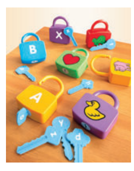
Alphabet Learning Locks