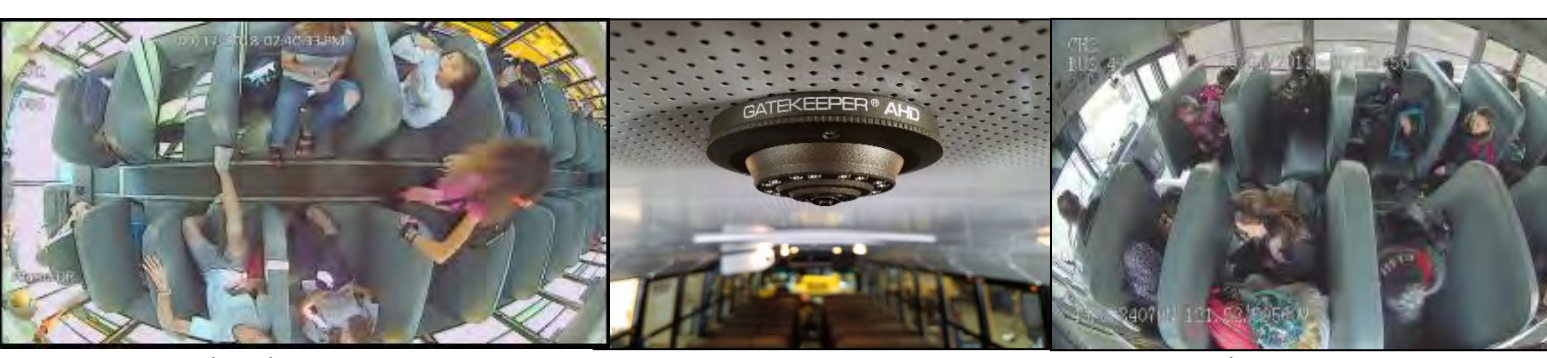
Overhead Mount Option