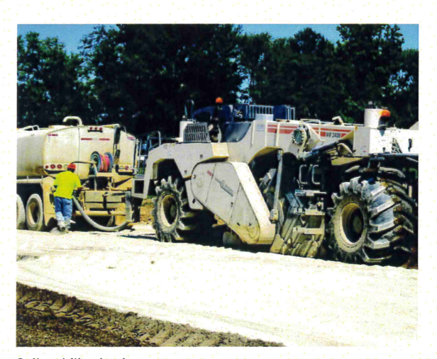
Soil stabilization in process

For more information, contact us at: www.byrneandjones.com