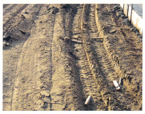
Example of failed subgrade

Let Byrne & Jones Stabilization show you the benefits of soil stabilization before you begin your next project.