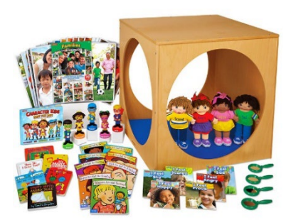
Example: Item # KT9204 - Social-Emotional Competence Support Kit for Toddler Programs built by our Custom Solutions Division

Custom Solutions Division-- where our team creates a custom approach to meet your unique needs.