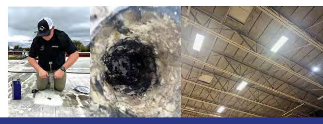
1-Performing Core Sample

Preventing Catastrophic Failures: Our cutting-edge thermal inspections allowed us to detect these anomalies before they became a costly emergency repair or worse. The gypsum roof decking(3), a material used in older roof systems, loses it's structural integrity when oversaturated and can unexptedly fail. Identifying this leak issue potentially averted a catastrophic and dangerous failure of the roofing system.