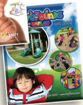
The Outdoor Classroom