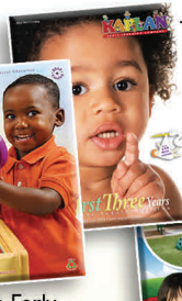
The First Three Years