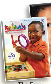
The Early Childhood Edition