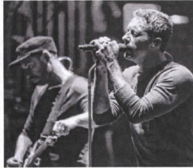
Jonny Buckland, left, frontman Chris Martin and Coldplay are out with their first studio album since 2011's Mylo Xyloto.