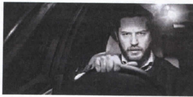
Locke (Tom Hardy) driving in his car. That's the whole movie.

Locke is a magnificent drama that resounds with powerful, universal themes. The sole actor on screen, Tom Hardy, gives a tour-de-force performance. But the real innovation lies in the way writer/director Steven Knight chooses to tell the tale — in real time and in a tightly constrained space.