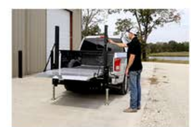
Load truck and raise the platform