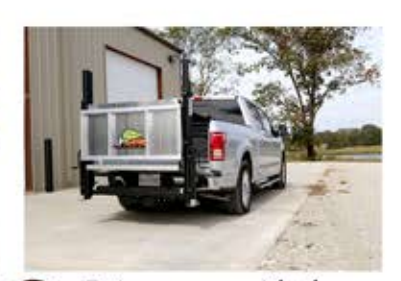
Drive away with the LiftGator attached