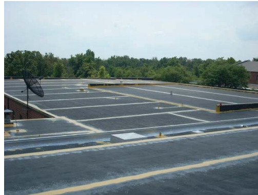
This photo is after roof restoration