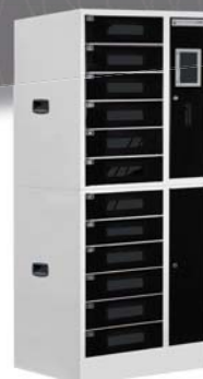
AC-LOCKER-12 12 Bay Locker Devices up to 17"