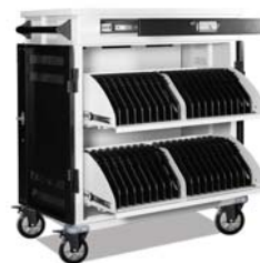
AC-PRO-II 40 Bay Smart Charge Devices up to 14"