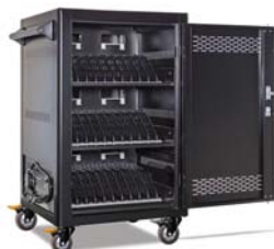
AC-LITE AC-LITE-PW45 (Prewired) 30 Bay Cycle Charge Devices up to 15"