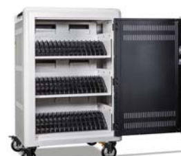
AC-45 45 Bay Smart Charge Devices up to 14"