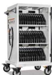
AC-SYNC 36 Bay Sync & Charge Devices up to 14"