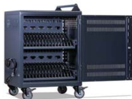
AC-30 30 Bay Basic Charge Devices up to 14"