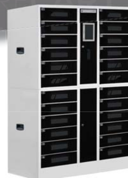
AC-LOCKER-24 24 Bay Locker Devices up to 17"