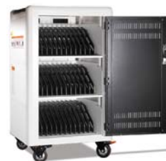
AC-PLUS-T 36 Bay Smart Charge Devices up to 14"