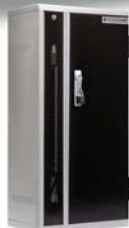
AC-VERT-16 16 Bay Cabinet Devices up to 14"