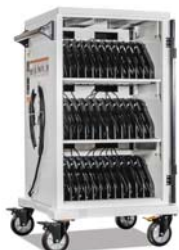
AC-SLIM AC-SLIM-PW45 (Prewired) 36 Bay Smart Charge Devices up to 15"