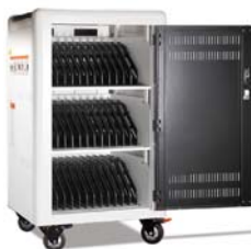
AC-PLUS 36 Bay Cycle Charge Devices up to 14"