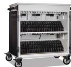
AC-MANAGE 36 Bay Smart / Networking Devices up to 17"