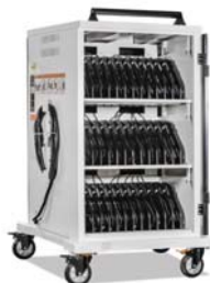
AC-MAX 36 Bay Smart Charge Devices up to 17"