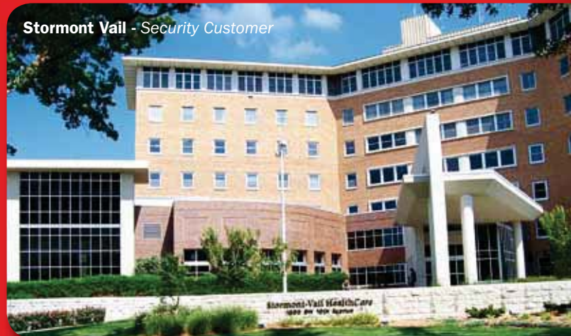
Stormont Vail - Security Customer