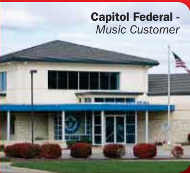
Capitol Federal - Music Customer

Sound Products offers specialized experience in four key areas of business. Our team of experienced and enthusiastic professionals understands exactly how sight, sound and security solutions can be used to meet the unique challenges and experiences of each industry.