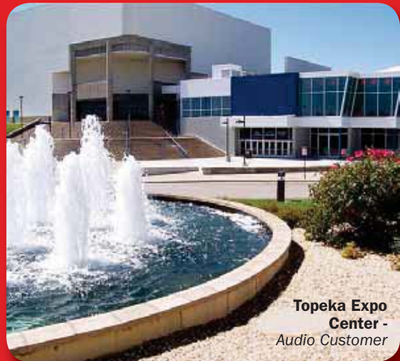
Topeka Expo Center - Audio Customer

Combine this specialized industry knowledge with our enthusiasm for your success and you get a kind of partnership you simply won't get from a vendor selling you equipment. Please visit our website to see how we've engineered VIBE for companies large and small.