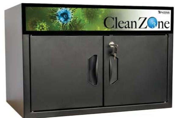
UP TO 16 DEVICES

The FDA, USDA and EPA have approved ozone as an antimicrobial disinfectant, killing 99.99% of pathogens.