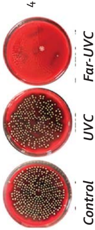
Fig. 2 Staph aureus