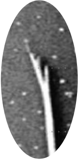
Fig. 1 Under the microscope: Pathogen destroyed instantly by the Far-UVC 222 nm lamp.

A 100mJ/cm2 dose achieves a greater than log reduction among the 5 most common pathogens. Similar surface kill rates can be achieved on solid surfaces and fabrics.