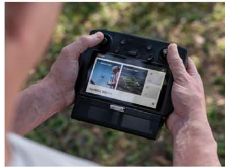
SMART CONTROLLER ENTERPRISE