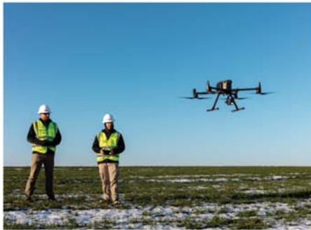
ADVANCED DUAL CONTROL