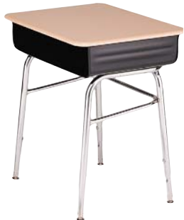
400 23 ½" - 29 ½" adjustable