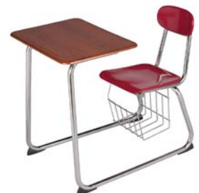
997 17" available