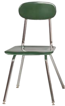
507 13 ½", 15 ½", 17 ½" available