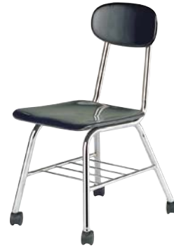
527 15 ½", 17 ½" available casters or music pitch optional