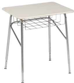
440 23 ½" - 29 ½" adjustable