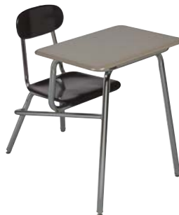
905 15 ½" or 17 ½" available