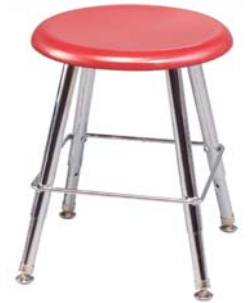
112 12", 18", 24", 30" fixed height or adjustable