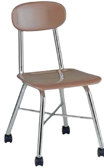
517 13 ½", 15 ½", 17 ½" available *casters optional