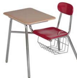
915 15 ½" or 17 ½" available