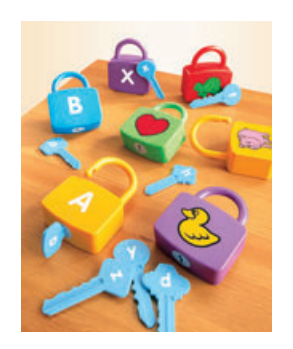
Alphabet Learning Locks