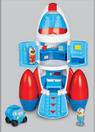
The finished product with learning and fun ready to "blast off"!