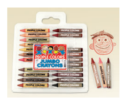
People Colors® Crayon Pack

As children grow, their developmental needs change. Our products for preschool & prekindergarten reflect this change-promoting learning and discovery, creative expression and social-emotional development.