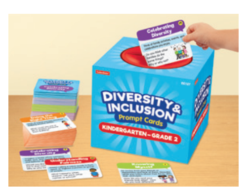
Diversity & Inclusion Prompt Cards

Our elementary products target core subject areas—from literacy, language and diversity to math, science and STEM. With an emphasis on versatility, we offer standards-based materials designed for a variety of instructional methods including project-based, small-group and independent learning.