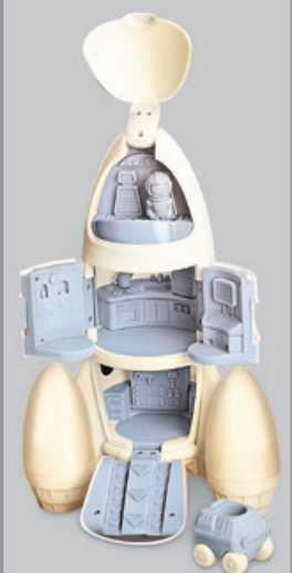
3-D printing and testing of the concept in real-world conditions.