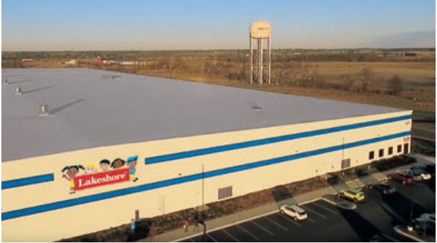
Our eastern distribution center in Midway, Kentucky.

Our products are available in over 70 countries—and the list is growing! Plus, Lakeshore distributors are committed to upholding our standards of excellence and service.