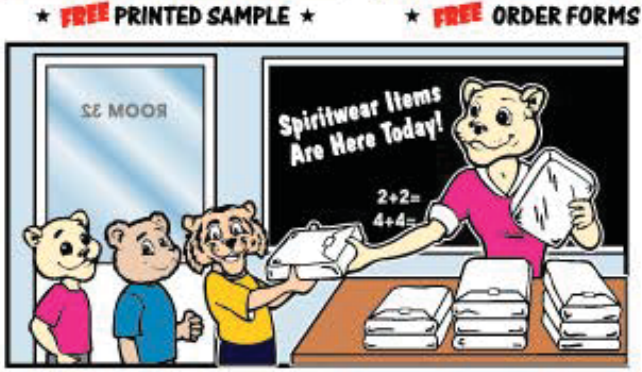
* EACH STUDENTS ORDER IS INDIVIDUALLY PACKAGED AND LABELED * * AT NO EXTRA CHARGE *