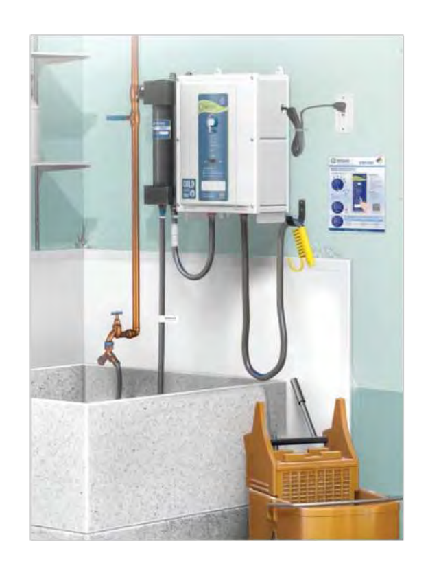
Let's see how it works ...