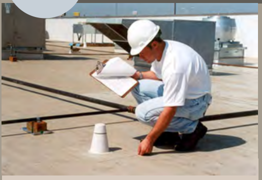
Perform quality inspection of roof by a supervisor