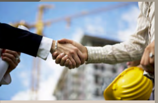
The Project Manager will conduct a final walk through ensuring satisfaction of installation