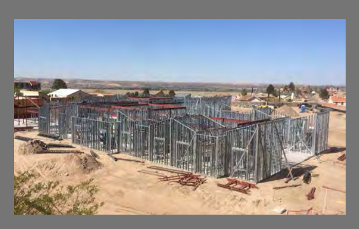
Good Samaritan Assisted Living Center El Paso, TX