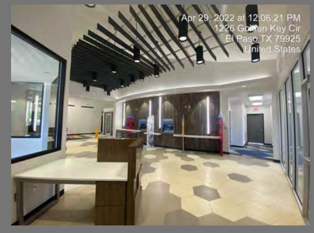
TI - Interior Renovation TFCU Golden Key Branch El Paso, TX