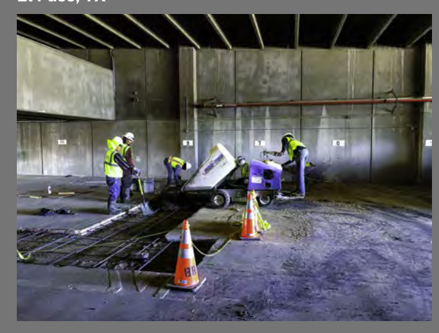
GSA - Replacement of Domestic Water & Sanitary Waste Lines at RC White Building - El Paso, TX