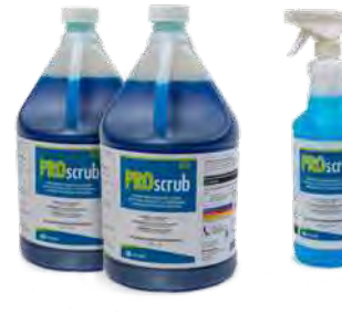
PROscrub RTD & RTU