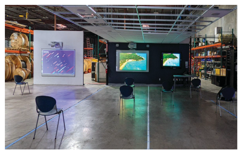
Image 1: 116" & 106" Screen Boards with EPSON BrightLink 1485Fi Interactive Projector vs. 65" Interactive Display.

The demonstration of MCA-certified specialized solutions compared the EPSON BrightLink 1485Fi Interactive Projector on a 106" Screen Board and a 116" Screen Board to a 65" Interactive Display, as well as teacher technology control on the wall, allowing the teacher to change technology sources from a single location.