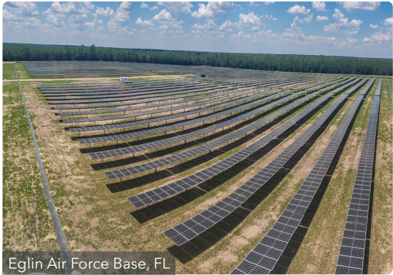
Eglin Air Force Base, FL