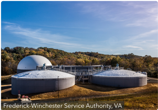
Frederick-Winchester Service Authority, VA

ESG’s projects with Eglin have had a positive impact on greenhouse gas emissions. ESG’s ESPC project alone reduces greenhouse gas emissions by more than 600,000 metric tons of carbon dioxide.