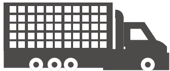
Without Wizard System

You don't need to pay to ship water. When you buy traditional pre-mixed products, you're paying to ship large quantities of water, increasing transportation costs.