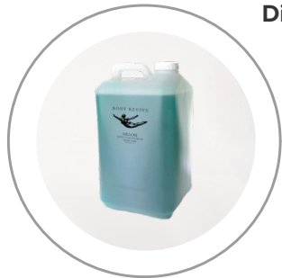
Dilute Body Soap Concentrate