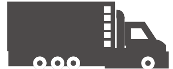
With Wizard System