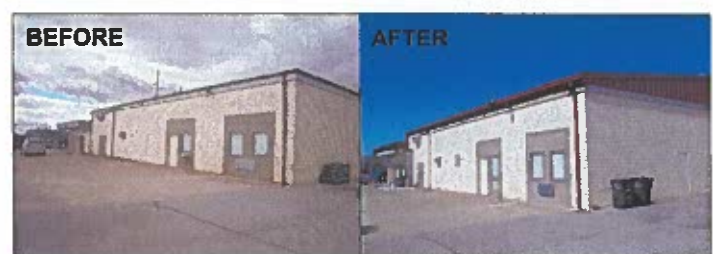
Hondo Community and Senior Center