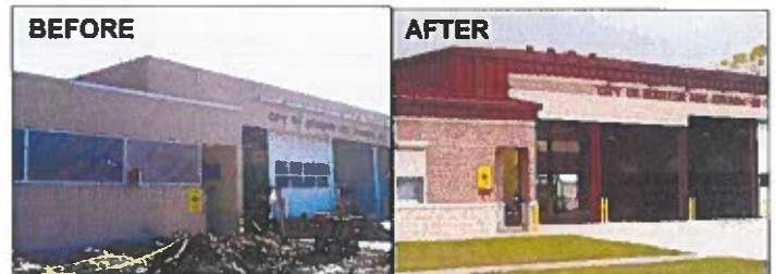
City of Houston Fire Station 29