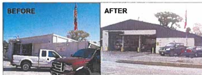
City of Houston Fire Station 38