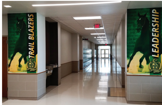
Composite Panels – Hallway End-caps