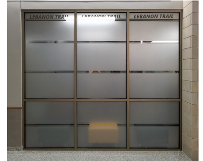
Frosted Vinyl – Counseling