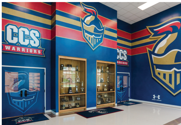
Wall Vinyl – Gymnasium Entrance