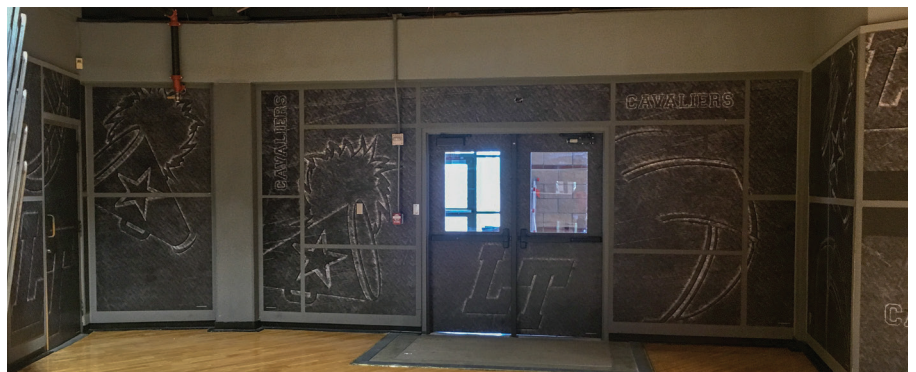
Composite Panels & Vinyl – Side Entrances