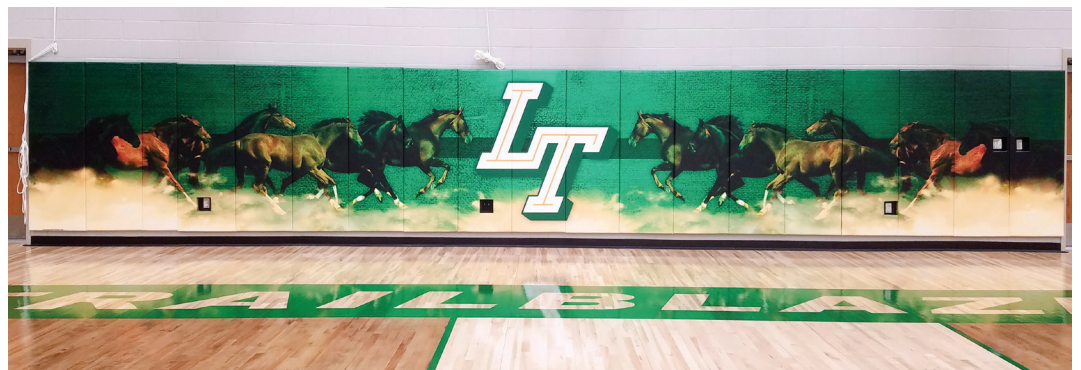
Vinyl – Gym Mats