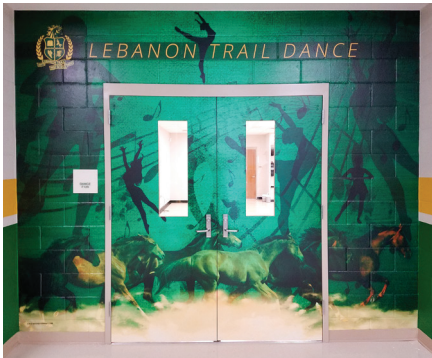
Vinyl – Arts Entrance