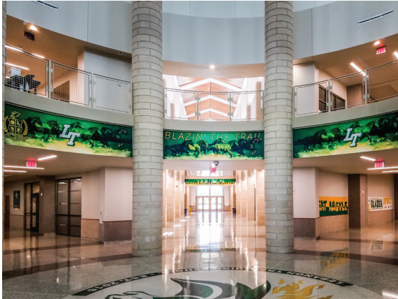
Wall Vinyl – Entrance Rotunda