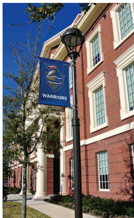
Pole Banners – Entrance