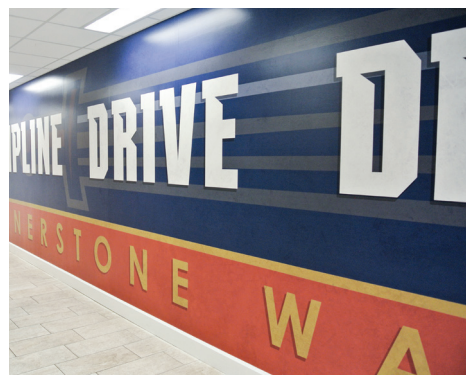
Wall Vinyl – Hallway