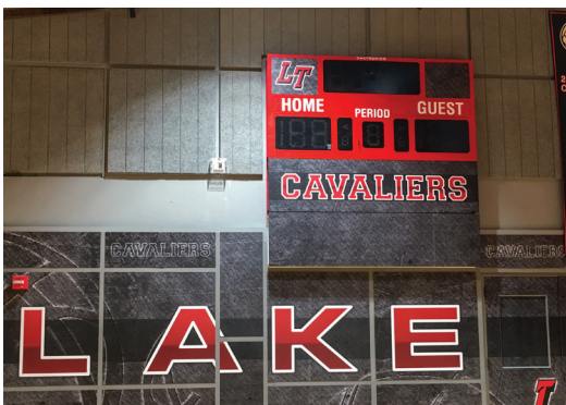
Vinyl – Scoreboard