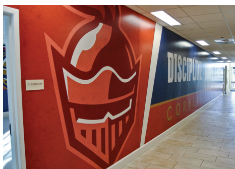
Wall Vinyl – Hallway