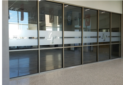
Frosted Vinyl – Hallway