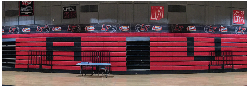
Composite Panels – Sponsor Signs