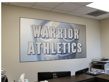
Aluminum Sign – Direct Print