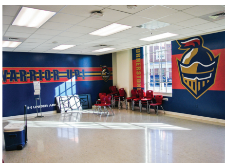
Wall Vinyl – Fieldhouse