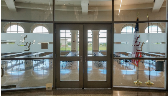
Frosted Vinyl – Library Entrance