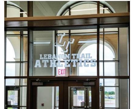
Frosted Vinyl – Athletics