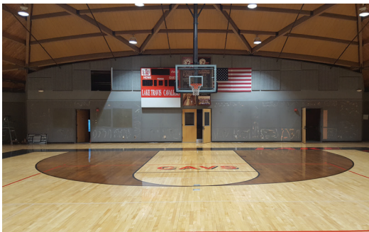
Gym surface prior to installation