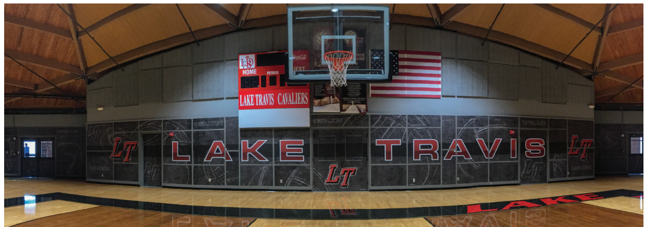
Gym with Composite Panels installed