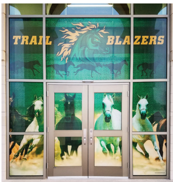
Window Perf – Athletics