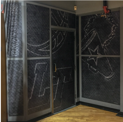
Composite Panels, Door Vinyl