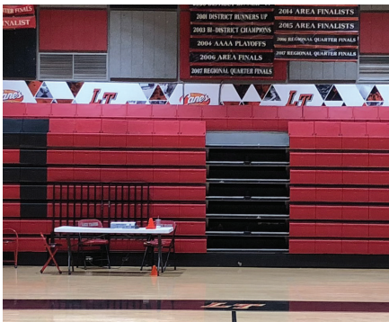
Sponsor Signs to replace